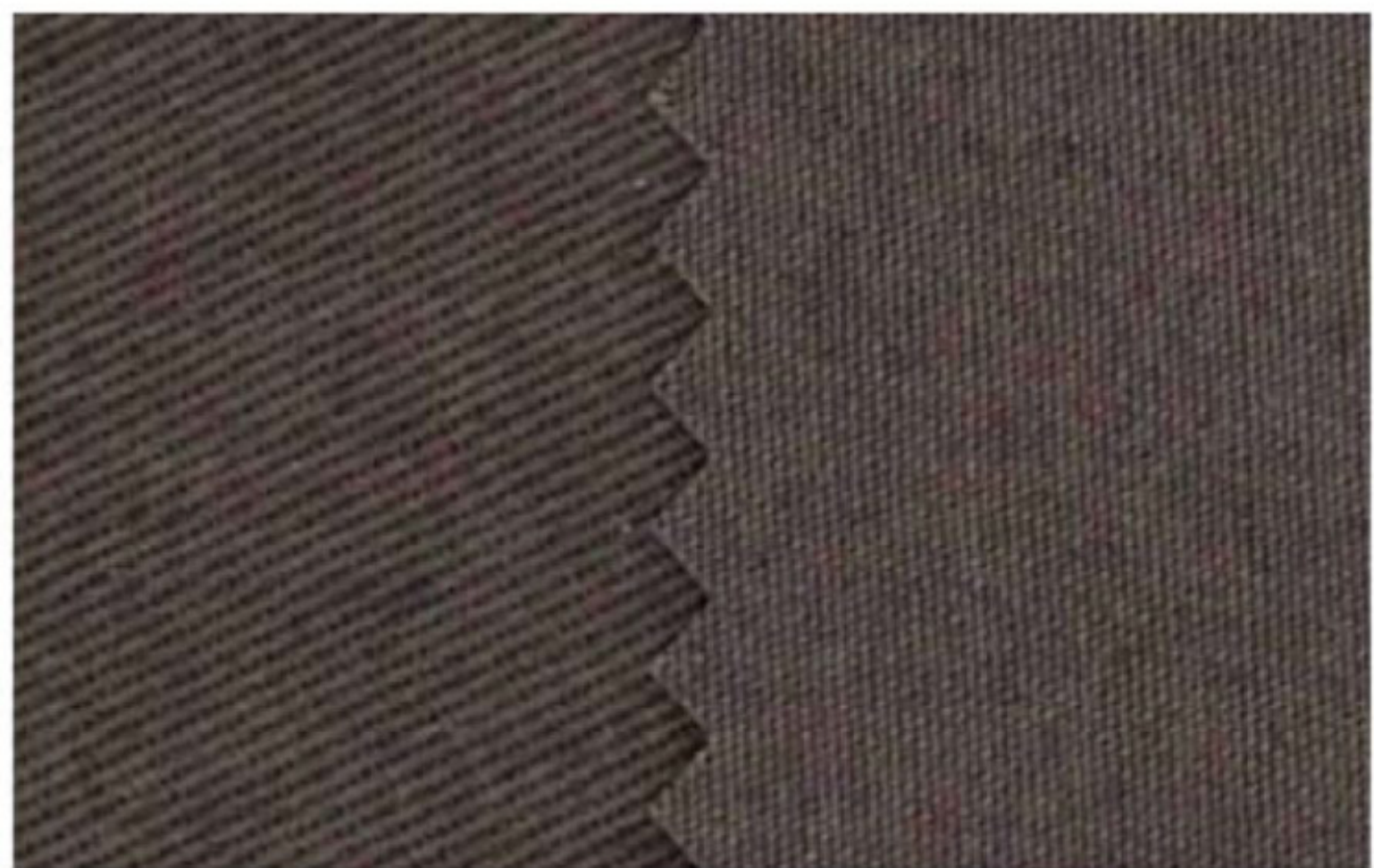
Face Side / Back Side