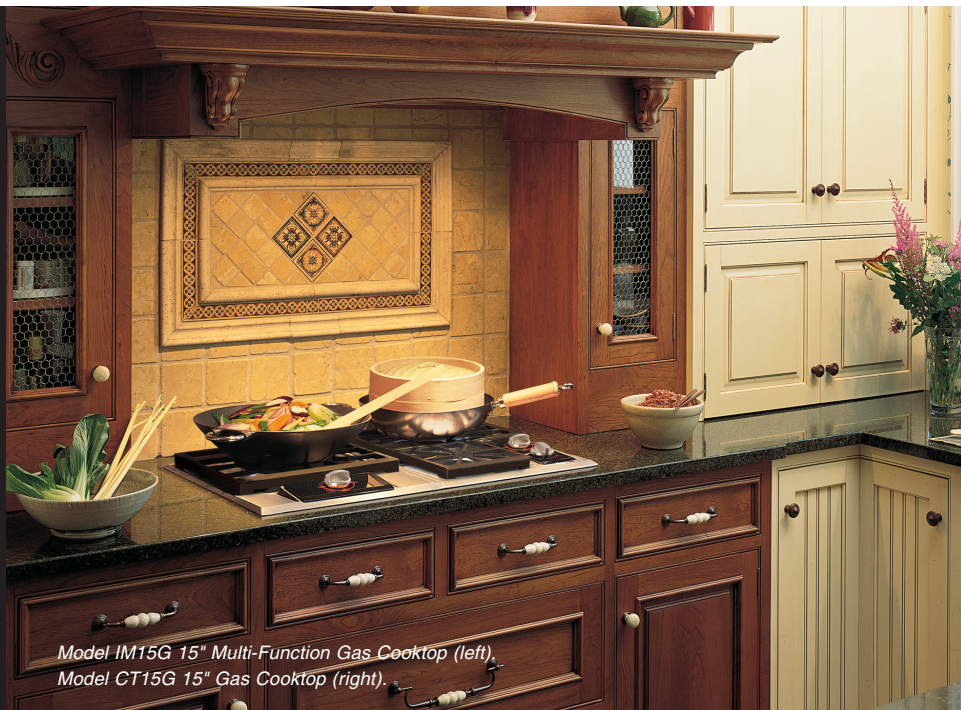
Model IM15G 15" Multi-Function Gas Cooktop (left) Model CT15G 15" Gas Cooktop (right)

The patented dual-stacked burner design of Wolf gas cooktops uses its upper-level burner for maximum heat transfer. Merely turn down the knob and the lower-tier burners delivers fine-tuning control and True Simmer. The sealed burners and deep recess of the seamless drawn pan make clean up a snap. Model CT15G is available in classic stainless steel finish and natural or LP gas.