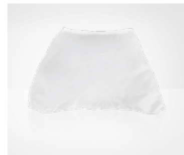
Filtro in nylon Nylon filter