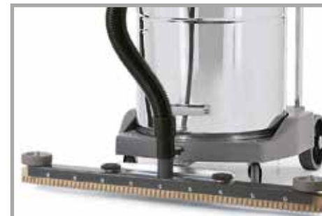
Accessorio fisso frontale Front mounted squeegee