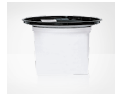
Filtro in stoffa permanente Permanent cloth filter

P: Fusto in polipropilene - Polypropylene tank A: Fusto in acciaio - Stainless steel tank W: Liquido - Wet D: Polvere - Dry M: Carrello fisso - Market trolley B: Carrello basculante - Tip & pour trolley