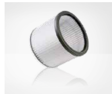
Filtro cartuccia HEPA HEPA cartridge filter