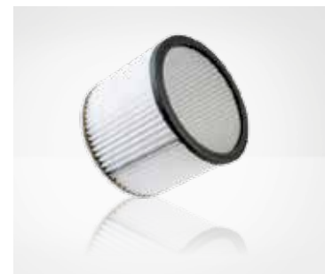
Filtro cartuccia lavabile Washable cartridge filter