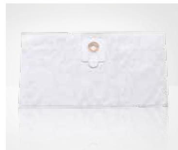
Sacco filtro microfibra Microfiber filter bag