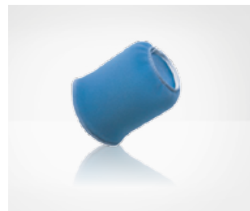
Filtro in spugna Sponge filter