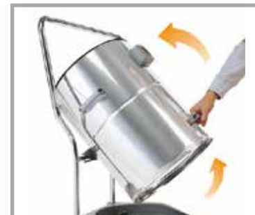
BASCULANTE - TIP & POUR

Il sistema di capovolgimento del fusto rende molto semplice lo svuotamento dello stesso Convenient "tip & pour" trolley system makes it easy and quick to empty the tank